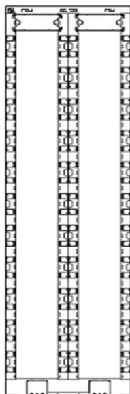
IBC-D3001 Front View