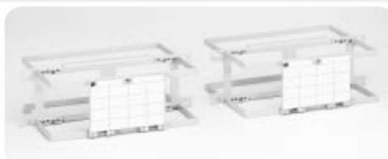
D3C-0016HD Front View